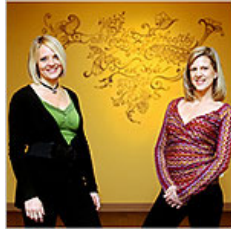
Yoga's Stress Relief: An Aid for Infertility?