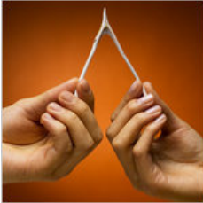
The Lucky Break of Rent Stabilization