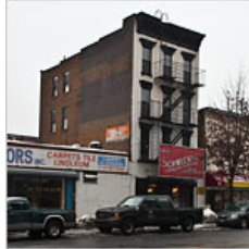
Blighted Area? These Business Owners Disagree