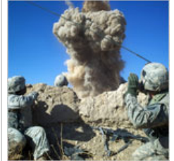
In Taliban Heartland, Coalition Forces Dig In

Home | World | U.S. | N.Y. / Region | Business | Technology | Science | Health | Sports | Opinion | Arts | Style | Travel | Jobs | Real Estate | Autos | Back to Top